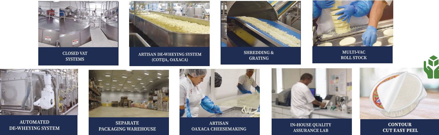
SUSTAINABLE PACKAGING REDUCES PLASTICS BY 33%

We bring together authentic artisanship with state-of-the-art manufacturing systems which enable us to produce dairy products with the authentic taste, freshness, quality, and value that our customers want.